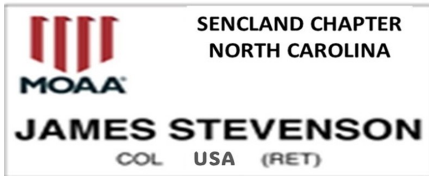
(Example of completed nametag)

When the nametags are received they will be available for pickup at Chapter luncheons or other events. If you have any questions, please contact Chris at villa_morin@hotmail.com or 703-798-1754 .