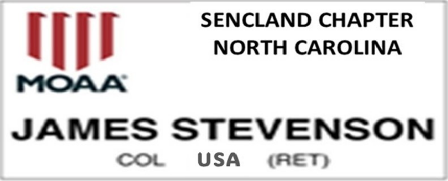
(Example of completed nametag)

When the nametags are received they will be available for pickup at Chapter luncheons or other events. If you have any questions, please contact Chris at villa_morin@hotmail.com or 703-798-1754 .